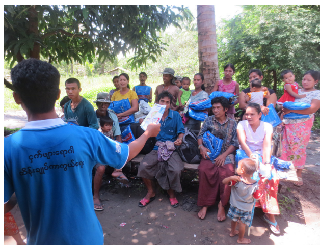
A village malaria worker provides health education to community members in Htaung Phee village in Bokpyin Township, Tanintharyi Region of Myanmar.

The use of VMWs requires a strong monitoring and supervision component to ensure quality of uninterrupted services by VMWs in the community. Operational costs are lower when the monitoring and supervision is integrated into local health systems and rural health staff are engaged