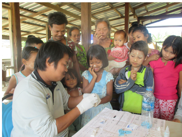
Mobile clinic staff conduct active case detection of malaria at Hte Hta village, Dawei in Taintharyi Region of Myanmar.

Mobile clinics visited 354 villages and work sites in remote areas.